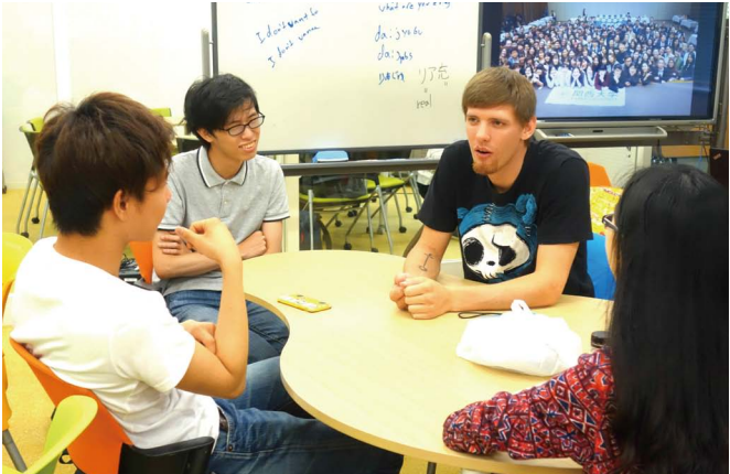
Mi-Room (Multilingual Immersion Room)

English : http://www.kansai-u.ac.jp/Kokusai/english/from/short.html